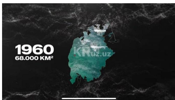
Figure 2 . Island of the sea in 1960 appearance