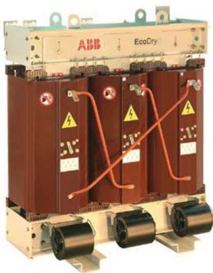
Figure 1 – Energy saving transformer ABB EcoDry Swiss type ABB

The ABB EcoDry series transformers, shown in Figure 1, have the lowest shunt and short-circuit losses of all general-purpose power transformers sold in the CIS and were selected in accordance with the recommendations of the European Electricity Committee (CENELEC).