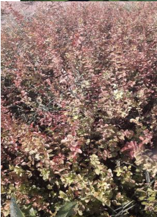
Figure 1. Lagerstroemia indica young seedlings in spring (May) and autumn (November).